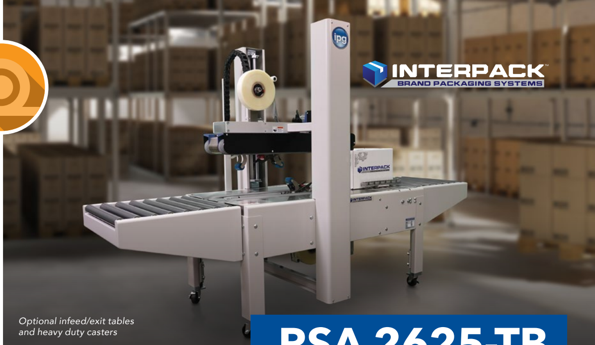
Optional infeed/exit tables and heavy duty casters