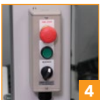
4 "Blocked" button for jams & replacing bottom tape roll