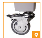
9 Optional swivel & locking casters