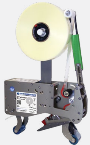
ET Xtreme™ Tape Head

Featured with the newly designed Interpack RSA case sealer is the next generation ET Xtreme™ tape head housing patented technology that safely provides optimal tape application and wipe down - even on recycled corrugate. Superior wipe down on each of the three taped panels is achieved with innovative design while minimizing force, thus, virtually eliminating crushed or damaged cases. When you compare features, benefits and value, Interpack Case Sealers are the right choice for your demanding job.