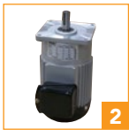
2 One 1/2 HP motor & one 1/4 HP motor