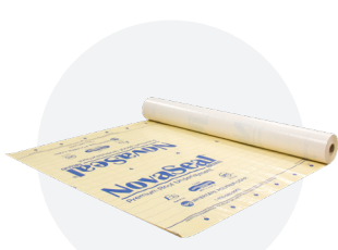
Engineered Coated Products