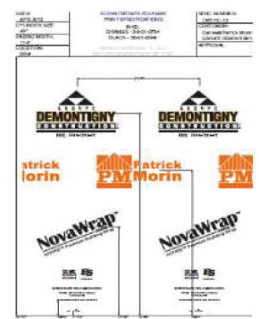
Customer Logo #1 Customer Logo #2 NovaWrap Logo