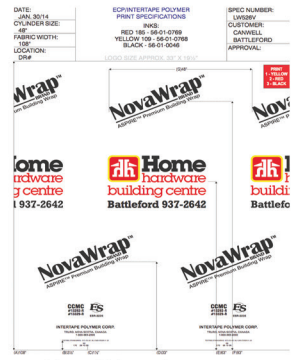
NovaWrap Logo Customer Logo NovaWrap Logo