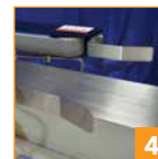
4 Case retainer in-feed guides