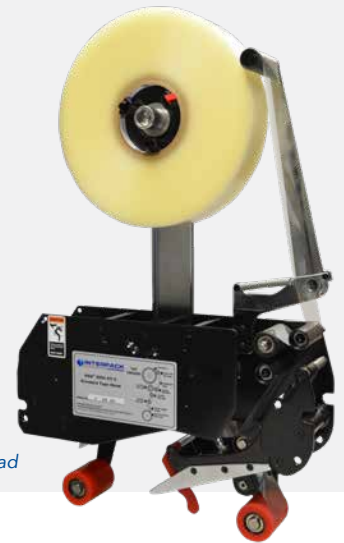
ET 2Plus tape head

When you compare features, benefits and value, Interpack™ Case Sealers are the right choice for operators, plant engineers, maintenance and purchasing.