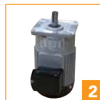
2 Twin 1/3 HP motors to process cases up to 85 lbs