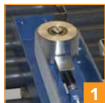
1 Self-tensioning & self-tracking drive belts simplify belt replacement