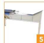
5 "T" rail station improves case set up and packing