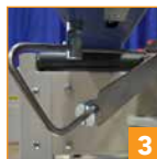
3 Rotating flap plows improve flap folding