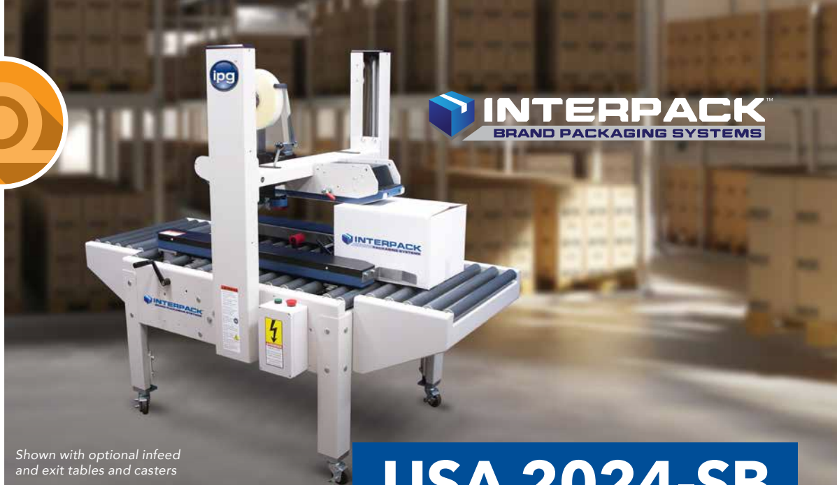
Shown with optional infeed and exit tables and casters