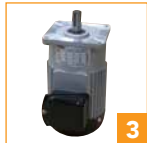
3 1/3 HP motors for heavy duty usage