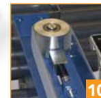
10 Self-tensioning & tracking side drives simplify belt replacement