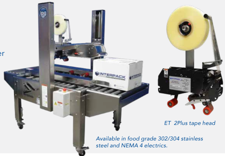
ET 2Plus tape head

When you compare features, benefits and value, Interpack™ Case Sealers are the right choice for operators, plant engineers, maintenance and purchasing.