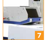
7 "Floating" upper head for mild overfills