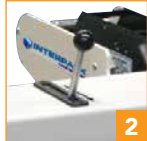
2 Single handle locks upper head to both columns