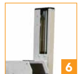
6 Slide & lock upper head for quick & simple size setup