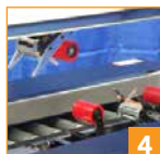
4 Offset tape heads process 2" high cases