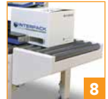
8 Optional infeed or exit tables available in 16, 24, or 36 inch lengths