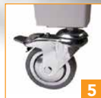
5 Optional swivel & locking casters