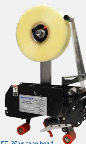
ET 2Plus tape head

When you compare features, benefits and value, Interpack™ Case Sealers are the right choice for operators, plant engineers, maintenance and purchasing.