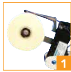
1 Tip up top tape head eases roll replacement