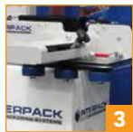
3 3 wheel top squeezer