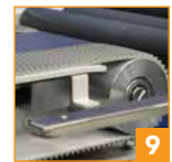
9 Self-tensioning & self-tracking drive belts simplify belt replacement