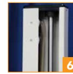
6 Slide and lock upper head eases case size setup