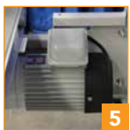
5 One 1/2 HP gear motor to process up to 85 lb cases