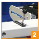
2 Single handle locks upper head to both columns