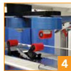
4 Offset tape heads process cases as low as 2"