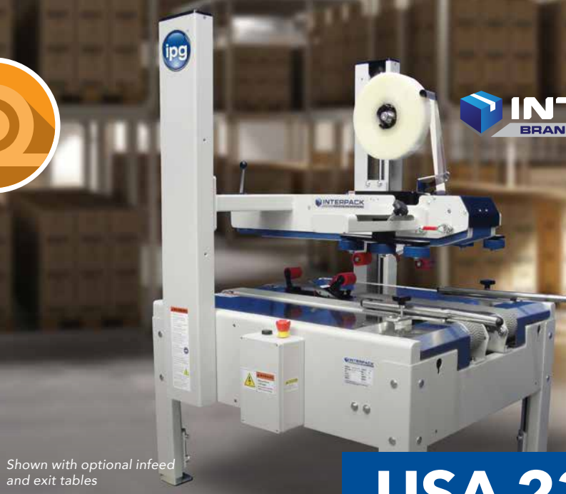
Shown with optional infeed and exit tables