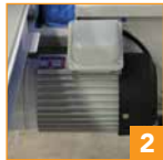
2 1/2 HP lower and 1/4 HP upper gear motors to process cases up to 85 lbs.