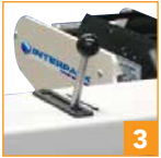
3 Single handle locks upper head to both columns