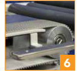
6 Self-tensioning & self-tracking drive belts simplify belt replacement