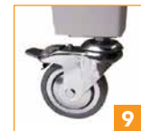
9 Optional swivel & locking casters