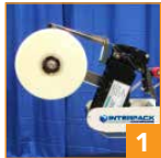
1 Tip-up tape head simplifies roll replacement