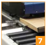
7 Horizontal self-centering guides for simple case size setup