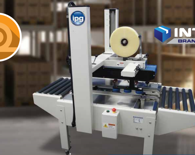
Shown with optional infeed and exit tables and casters