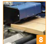
8 Processes OPFs as low as 1/2" tall