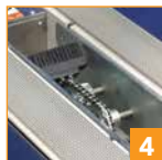
4 Pneumatic wipe down unit folds tape leg underneath the case for secure seal