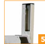
5 Slide & lock upper head for quick & simple size setup