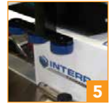
5 3-wheel top squeezer