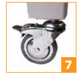
7 Optional swivel & locking casters