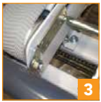
3 Self-tensioning & self tracking 3" wide drive belts