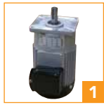
1 1/2 HP lower and 1/4 HP upper gear motors to process cases up to 85 lbs.