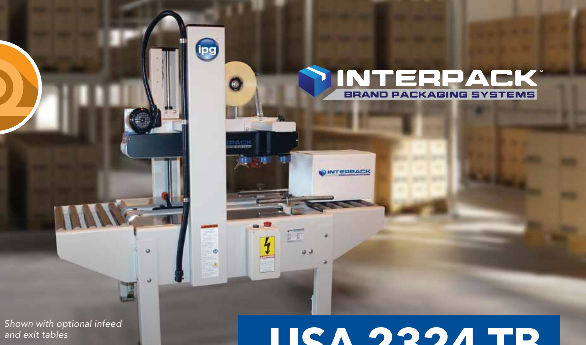
Shown with optional infeed and exit tables