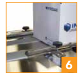
6 Horizontal self-centering infeed guides