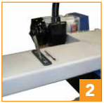
2 Single handle locks upper head to both columns