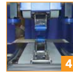
4 Top & bottom belt drive is the best system for case sealing