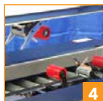
4 Offset tape heads process 2" high cases