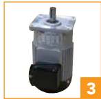
3 1/3 HP motors for heavy duty usage