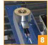
8 Self-tensioning & tracking side drives simplify belt replacement