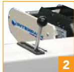
2 Single handle locks upper head to both columns