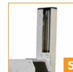
5 Slide & lock upper head for quick & simple size setup