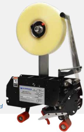
ET 2Plus tape head

When you compare features, benefits and value, Interpack™ Case Sealers are the right choice for operators, plant engineers, maintenance and purchasing.