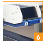
6 "Floating" upper head for mild overfills