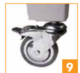
9 Optional swivel & locking casters