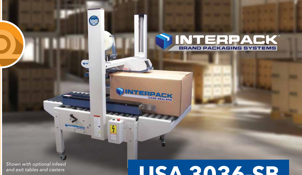
Shown with optional infeed and exit tables and casters