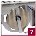
7 Easy bottom roll change