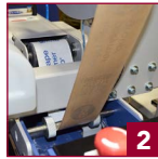
2 Powered tape unwind