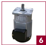
6 1/3 HP motors allow up to 85lb case processing