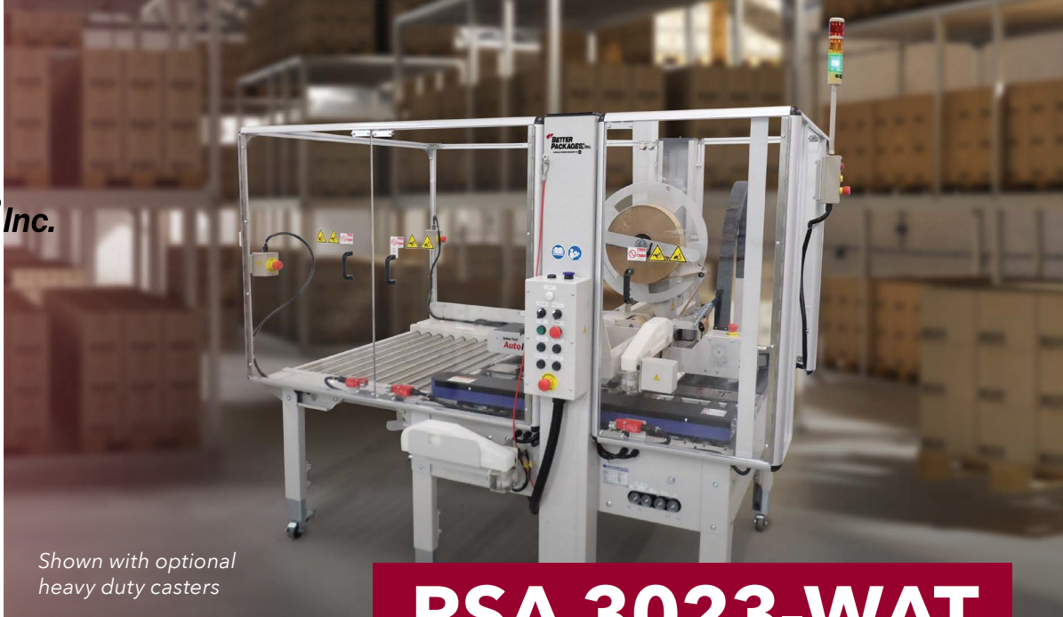
Shown with optional heavy duty casters