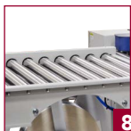
8 Powered exit conveyor to ensure even small cases exit completely