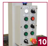
10 Manual & automatic controls with easy jam clearing