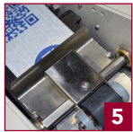
5 Easy tape threading