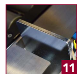
11 Pneumatic index gate