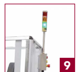
9 Standard low/no tape and water sensing to alert operators when to refill