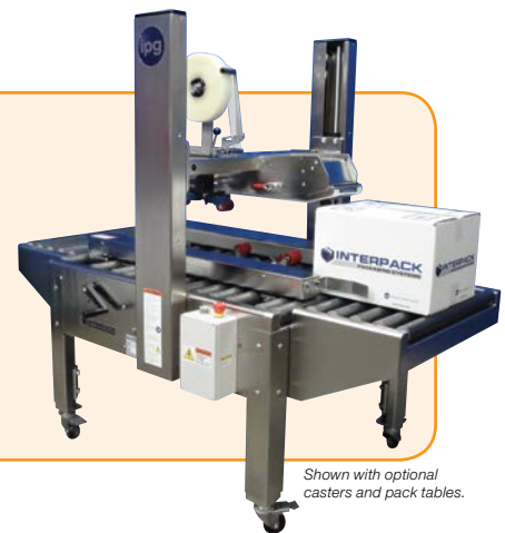
Shown with optional casters and pack tables.