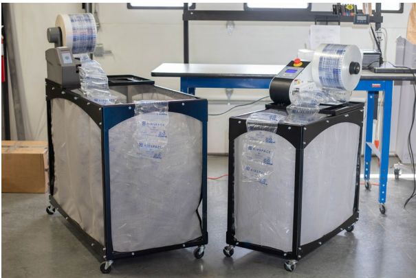
Rover Portable Cart, large and small