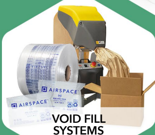
VOID FILL SYSTEMS