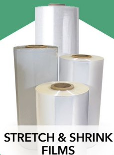
STRETCH & SHRINK FILMS

We offer a wide range of differentiated performance-advantaged solutions across carton sealing tape and equipment, protective packaging, and automation.