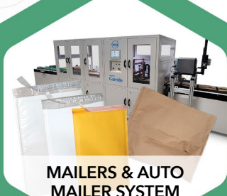
MAILERS & AUTO MAILER SYSTEM