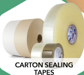
CARTON SEALING TAPES