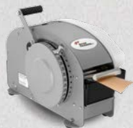
BP333 Plus with Heater