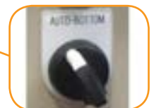
Top & bottom or bottom only seal operation modes