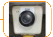
"Clear" button for jams & replacing bottom tape roll