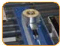
Self-tensioning & tracking side drives simplify belt replacement