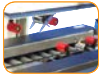
Offset tape heads process 2" high cases