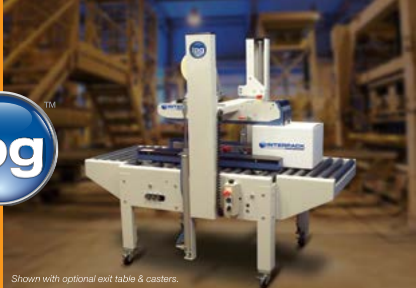
Shown with optional exit table & casters.