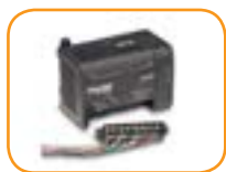
Digital pneumatics to improve throughput speed