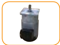
1/3 HP motors for heavy-duty usage