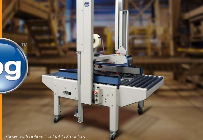
Shown with optional exit table & casters.