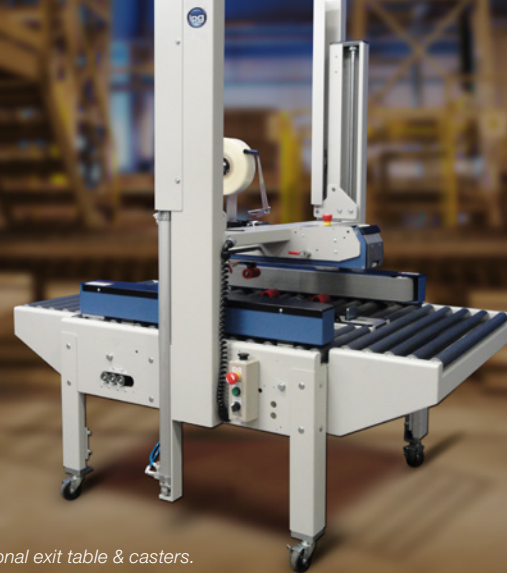
Shown with optional exit table & casters.