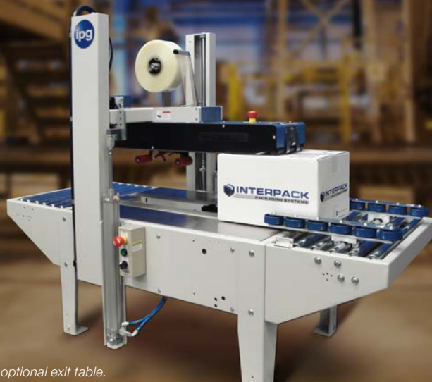
Shown with optional exit table.