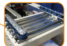
Horizontal centering guides with rollers