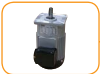
One 1/3 HP motor, and one 1/4 HP motor