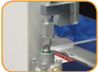
Selectable minimum height