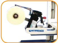
Tip up top tape head simplifies roll replacement