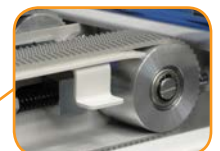
Self-tensioning & self-tracking drive belts simplify belt replacement