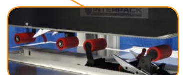
Offset tape heads process cases as low as 2"