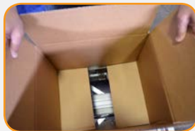
Minor flaps are folded pneumatically