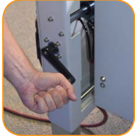
Hand-crank case width adjustment