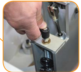
Locking ratchet handle for case length adjustment