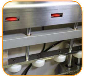
Rubber retaining wheels secure the case after flap folding