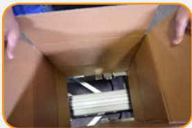
Form case into a sleeve then insert into machine