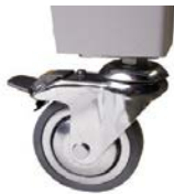
Swivel & locking casters