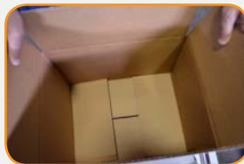
Major flaps are folded pneumatically