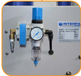
All pneumatic operation; no electric required