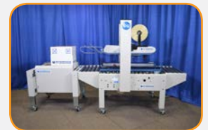
Combine with a uniform case sealer for a complete system