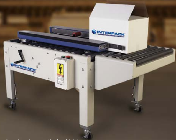
Shown with optional casters and in-feed table.