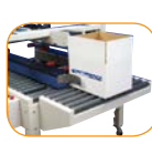
In-feed and exit tables