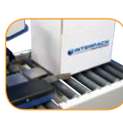
Box hold down device