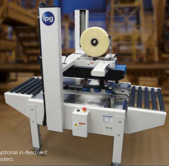
Shown with optional in-feed/exit tables and casters.