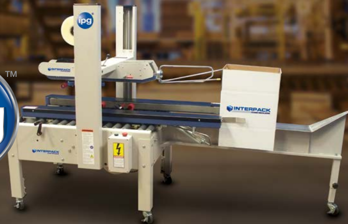
Shown with optional casters