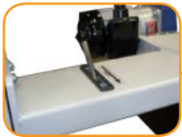
Single handle locks upper head to both columns