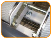
Self-tensioning & self-tracking 3" wide drive belts