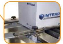
Horizontal self-centering in-feed guides