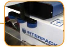
3 wheel top squeezer