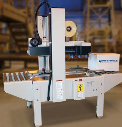
Shown with optional in-feed and exit tables.