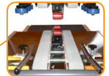
Top & bottom belt drive is the best system for case sealing