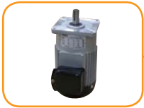
½ HP lower & ¼ HP upper gear motors to process up to 85 lbs