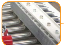
Side belt drive with belt over roller technology