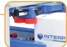
2-wheel top squeezer