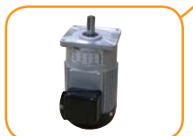
¼ HP gear motors to process up to 65 lb cases