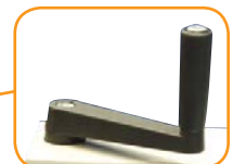
Threaded rod upper head lifting