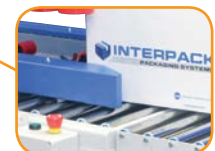
Convenient in-feed guides