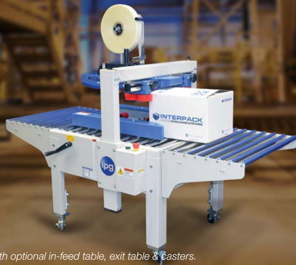
Shown with optional in-feed table, exit table & casters.