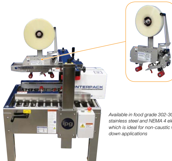
Available in food grade 302-304 stainless steel and NEMA 4 electrics, which is ideal for non-caustic wash-down applications