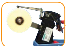
Tip-up tape head simplifies roll replacement